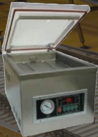
TABLE TOP VACUUM PACKAGING MACHINE